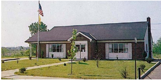
Original Morgan Blvd. Office

We at SJFCU see our anniversary year as a celebration of not only our growth and our past achievements, but also a chance to look forward to anticipated new growth while maintaining our commitment to world-class member service in the years to come.